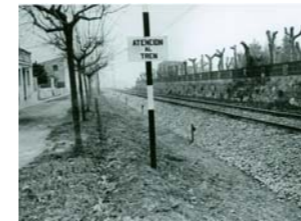
1- The place where Francisco Sabaté got off the 1104 train