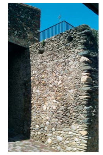
Section of the wall

The sloping base of the tower was left uncovered recovering the original ground level during the XIX-XV centuries.