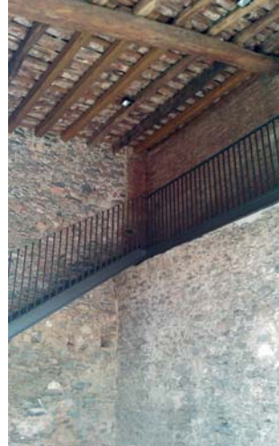
Staircase leading to the top of the tower