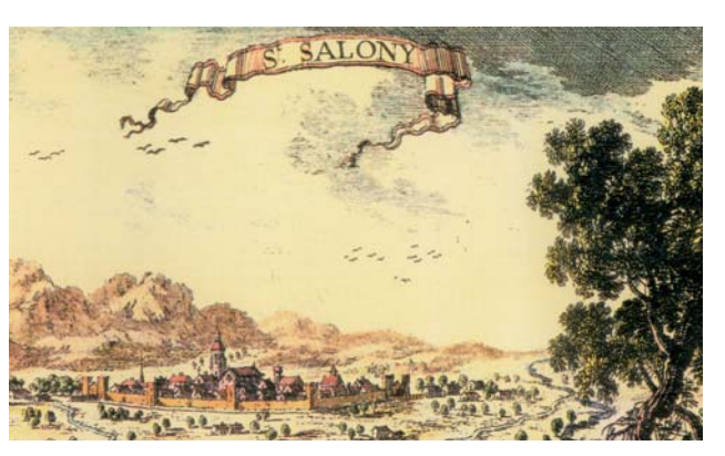
A reconstruction of the fortified town. French engraving from the XVII century

When it was no longer useful for defence purposes the wall began to decline. In 1681 the moat was divided up and sold off as vegetable plots in order to help pay for the building of the new parish church (houses were later built on these plots), and in 1865 the Girona gate also known as Sants Metges, was pulled down. After these events all that remained of the walled precinct of Sant Celoni was the dividing wall between the houses Carrer Major and those between Carrer de les Valls and Sant Roc as well as the facade of some of the houses on Plaça Bestiar. Of the five original towers only two still stand today plus the angle of a third tower. The most prominent of the two is known as Ca l'Aymar and it is perfectly visible from Plaça Josep Alfaras. The tower that was restored in 2009 is the one in Carrer Valls.