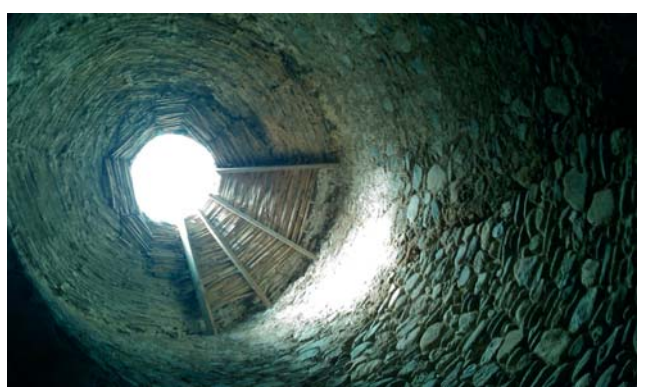
Inside dome of the tower